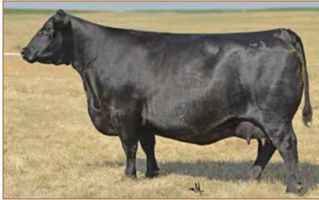
BALDRIDGE ISABEL Y69 Donor Dam of Lots 94-96