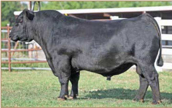
CA PAPPY 1052 Maternal Brother to Lot 35 sold in 2023