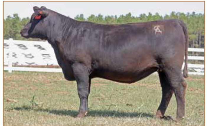
CA RITA 1056 Maternal Sister to Lot 141 sold in 2022