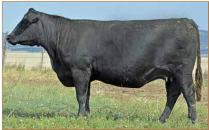
DIABLO ERICA DIANNA 9034 Donor Dam of Lot 146