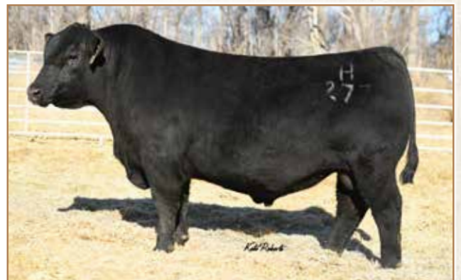
BALDRIDGE HEADSTART Service Sire