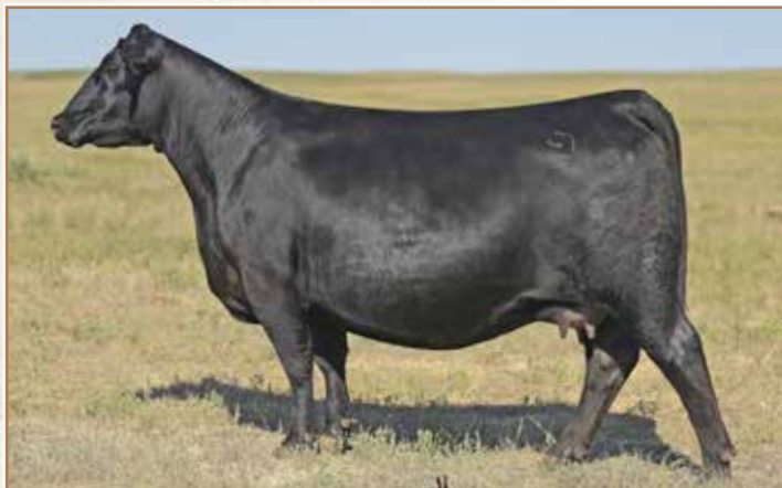
BALDRIDGE ISABEL F047 Donor Dam of Lot 93