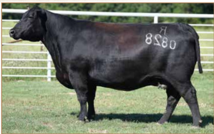
RRR PRATISSA R0828 Donor Dam of Lots 1-6, 85, 100

Top 2% of the breed for WW and top 1% for DOC.