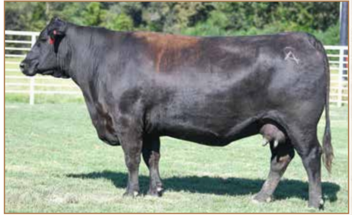
CA RITA 589 Donor Dam of Lots 7-9, 46 • Sells as Lot 97