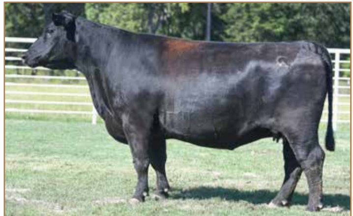
POWELL ERICA 8397 Donor Dam of Lots 18, 92, 110-111 • Sells as Lot 147

The Powell Erica cow family this and the previous five bulls hail from have made significant impact on the breed through performance and carcass value.