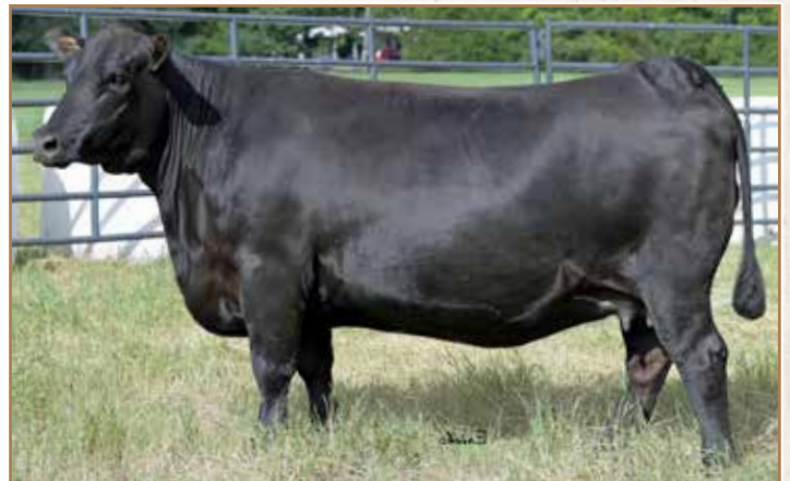
PINE VIEW SUSANNA D417 Donor Dam of Lots 98-99, 139