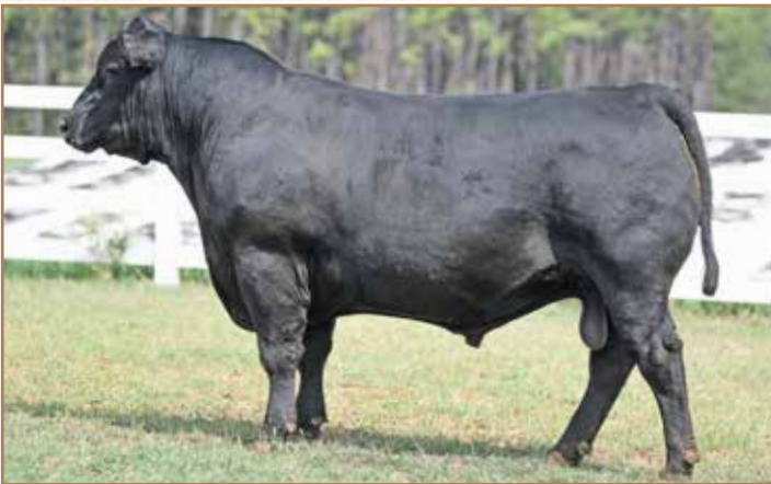
CA DEADWOOD 1119 Son of Lot 97 sold in 2023