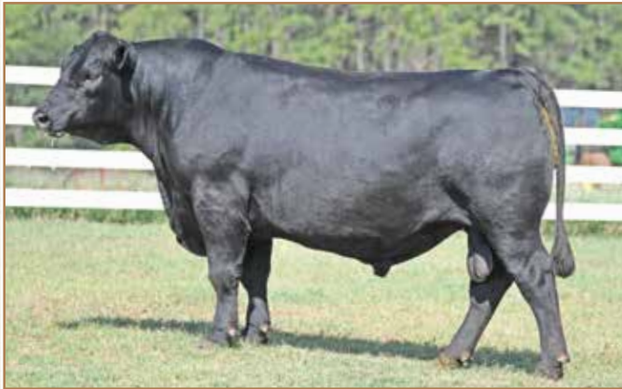
CA CLARITY 1012 Maternal Brother to Lot 141 sold in 2023