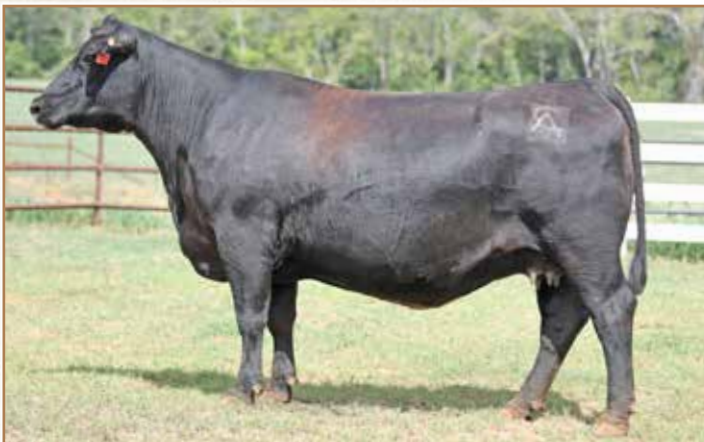
CA JAUNTY BLACKBIRD 555 Donor Dam of Lots 36-37, 113

Great for heifers and growth ranking in the top 4% of the breed for YW EPD.