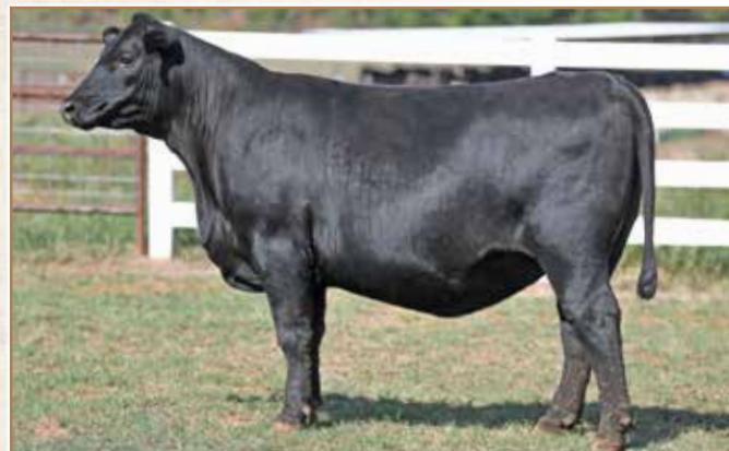
CA RITA 1005 Maternal Sister to Lot 124 sold in 2023