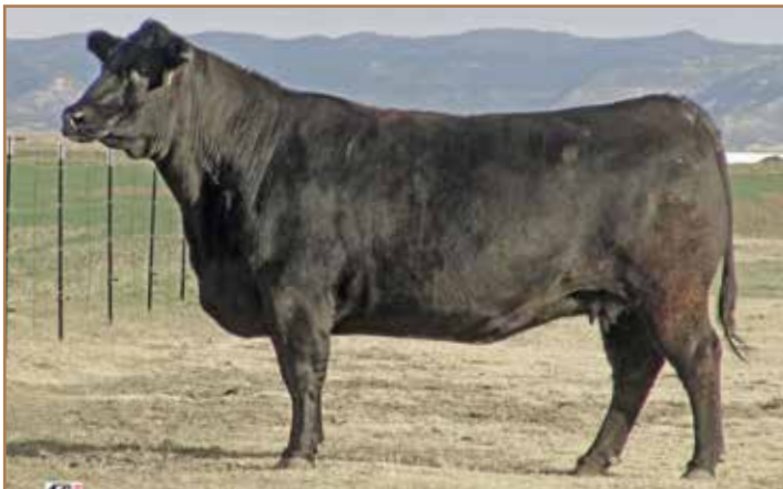
DSA NEW DIRECTION 1022 Donor Dam of Lot 103