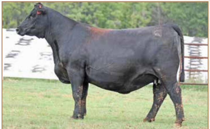
CA 1022 RITA 835 Daughter of Lot 103 sold in 2023