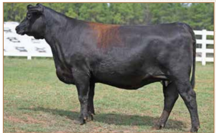
CA SUSANNA 800 Full Sister to Lot 139 sold in 2023