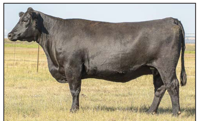
DAM OF LOTS 27, 31, 32, 42 CAM Sunrise A6052