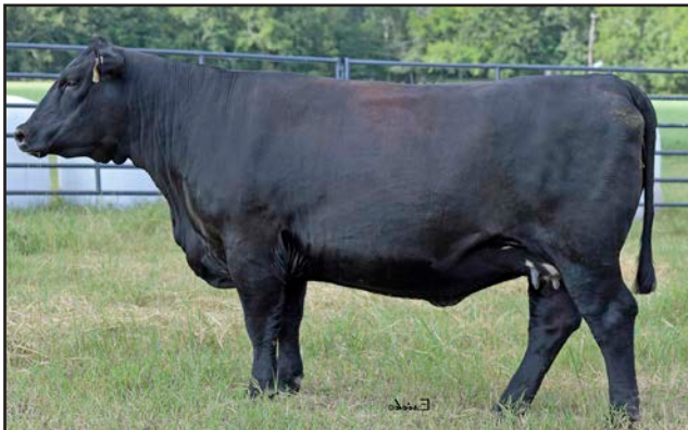
DAM OF LOTS 15, 16, 44, 47 E W A 678 of 3128 Sure Fire

Recommended for heifers or cows, BW 66 lbs. Ranks in top 25% for 17 different EPDs or $Values. Herd bull prospect with top 1% EPDs for RE and Angle, top 2% for $C, $B and $C. Only bull in the breed with his combination of RE, Marb, CED, Angle, Claw, $C, and BW. His dam is a young, valued donor in the program. Sale day favorite right there.