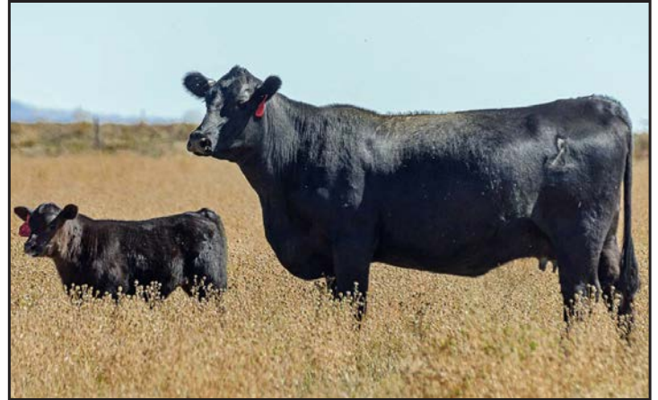
DAM OF LOTS 1, 2 RRR Rita R0397

Herd bull prospect who traces to the great DSA New Direction 1022. Recommended for heifers or cows with a BW of 74 lbs and top 25% for 18 EPDs or $Values. Big scrotal and huge muscle expression on 882. His sire, Baldrige Pappy, was a past $110,000 top selling bull at Baldrige Performance Angus, NE.