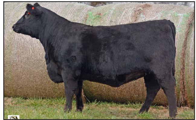
DAM OF LOTS 5,6 Dsa Rito 9Q13 1022 1417

Recommend for heifers or cows, BW 76 lbs. Records 14 different EPDs or $Values in top 25%. A sale day favorite who carries as much muscle as any bull in the offering.