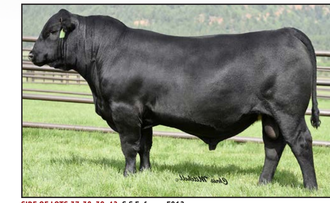
SIRE OF LOTS 37, 38, 39, 42 S S Enforcer E812

Recommended for heifers or cows, BW 70 lbs.