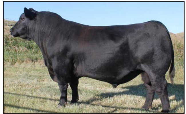
DAM OF LOTS 35, 36 Hoover No Doubt

Recommended for cows, BW 76 lbs. Ranks in the top 25% for 19 different EPDs or $Values including top 1% for $C, Doc, WW and YW.